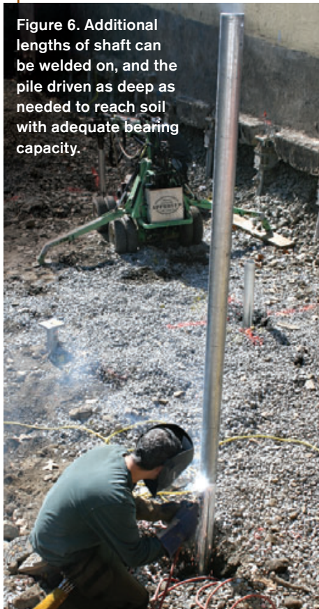
Figure 6. Additional lengths of shaft can be welded on, and the pile driven as deep as needed to reach soil with adequate bearing capacity.

usually relates to the amount of torque required to install it, a function of both the size of the helical plate and the soil's bearing capacity. A pressure gauge on the installation machine reads the torque as the pile is rotated into the ground ( Figure 5, previous page ).