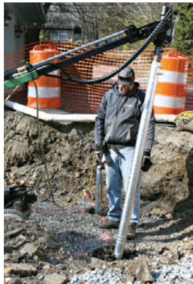
Figure 8. Sometimes, the pile has to be steered around a below-grade rock by moving the driver's boom. Once the obstruction is passed, the boom pulls the shaft plumb again.