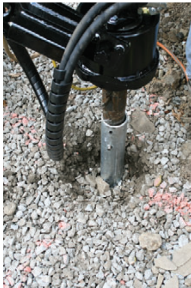
Figure 7. You wouldn't know it by looking, but this pile penetrates about 13 feet into the ground. Helical piles don't create piles of waste soil the way conventional footings do.

When a large rock is encountered above the frostline, it can be drilled and the pile's shaft pinned to the rock sans helix. Occasionally, however, there is so much rock on the job that helical piles just won't work. There are some locations where I don't even bother trying to install piles because every lot on the street was blasted out of bedrock. In places like that, different methods need to be employed.