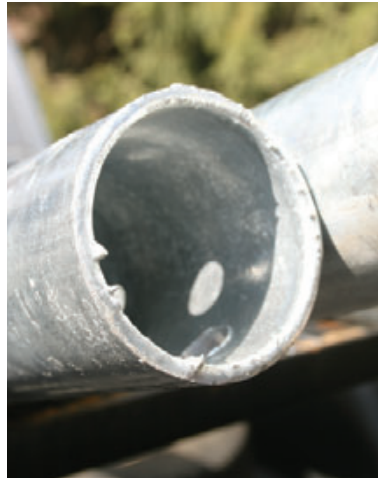
Figure 2. A thick coating of zinc protects the steel piles from corrosion.