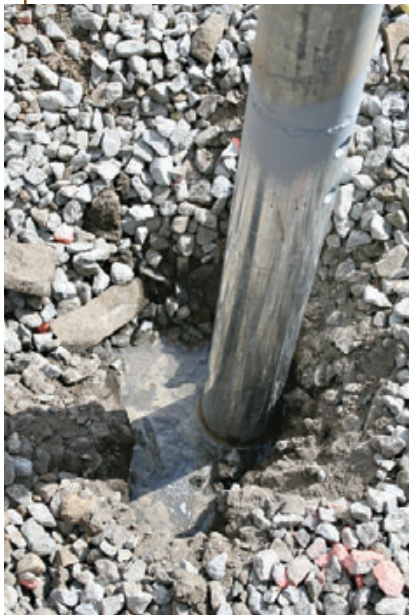
Figure 11. It would have been impossible to dig a traditional footing in this ground without it filling with water.