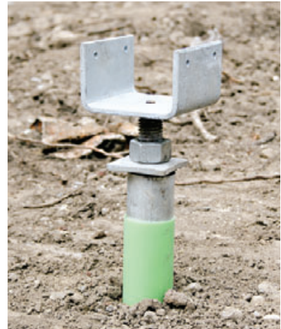
Figure 3. Several types of caps are available to attach piles to framing. Some can be adjusted in height to fine-tune a deck's elevation.

the contractor to inquire about what he had used. His answer — helical piles — changed my business.