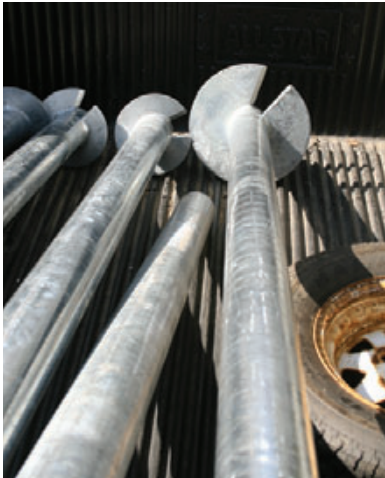
Figure 1. Helical piles are screw-shaped plates welded to a steel shaft. Various sizes are available for different soils and applications.