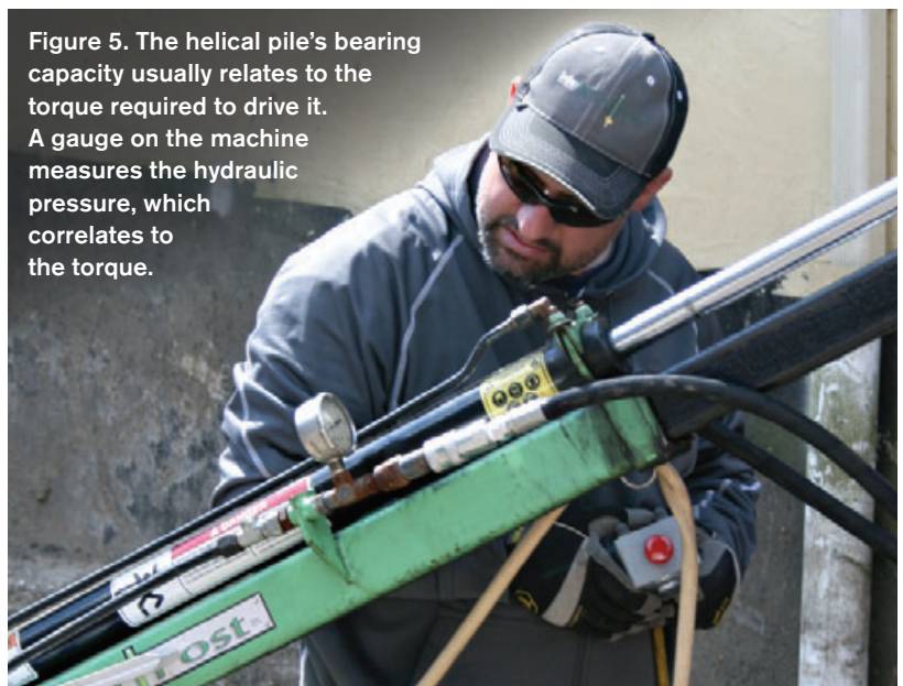
Figure 5. The helical pile's bearing capacity usually relates to the torque required to drive it. A gauge on the machine measures the hydraulic pressure, which correlates to the torque.

Helical piles are screwed into the ground to below the frostline using hydraulic machinery (Figure 4). The load-bearing capacity of a helical pile